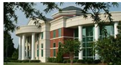
Thomas Goode Jones School of Law