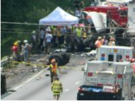
Photo of devastation caused by fatigued driver in South Carolina

Abiding by the regulations set forth by the FMCSA, especially the HOS, can save lives. Since the last major change to the HOS that was done in 2004, the National Highway Traffic Safety Administration (NHTSA) said the trucking industry has never been safer. There was a twenty percent reduction in fatalities involving large trucks from 4,245 in 2008 to 3,380 in 2009. This is the lowest number of annual truck related fatalities in recorded Department of Transportation history and represents a 33 percent decrease in fatalities since the improved hours-of-service regulations first became effective in January 2004. xxxiii The transportation of commercial goods via trucks has benefitted and transformed our country; it has effectively provided Americans with the convenience of goods from across the nation and other countries. The safety of those that operate the CMVs and those they share the road with is paramount. Countless studies and statistics show that a strict enforcement of the HOS is necessary to save lives and increase efficiency of the commercial trucking industry. Accidents involving large trucks will happen, but many, especially those related to fatigue, can be avoided by following the regulations set forth by the FMCSA.