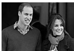
Kate Middleton Drops Jaws, Proving Prince William Is A Luc... Livingly