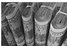
Brilliant Mortgage Payoff Method Has Banks On Edge Comparisons.org