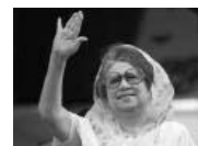
Khaleda Zia issues rare rebuke of Hindu priest's killing