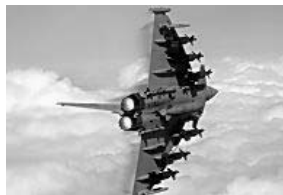
This Is Why You Don't Mess With The US! Watch What Happens HolyHorsepower