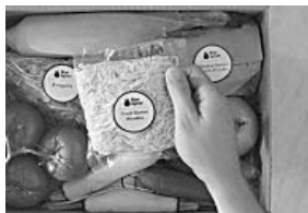
We Tried Blue Apron: Here's What Happened Liberty Project for BlueApron