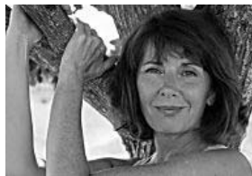
10 Worst Mistakes People Make After Retirement TheFinancialWord.com