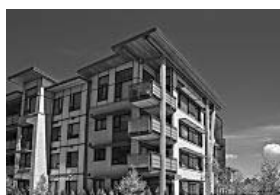
Higher Returns than REITs: Investing in Real Estate is... TechCrunch by RealtyShares