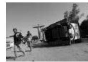
Angry victims heckle Haryana CM after Jat riots kill 19